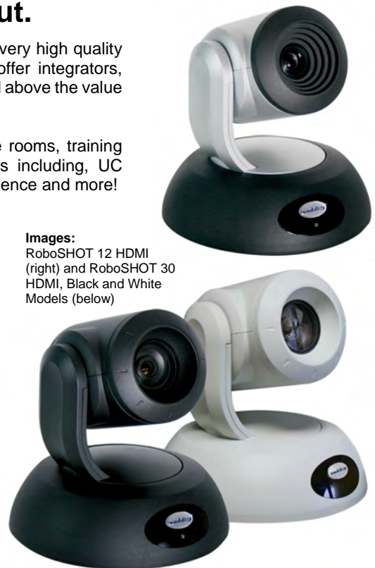
Images: RoboSHOT 12 HDMI (right) and RoboSHOT 30 HDMI, Black and White Models (below)